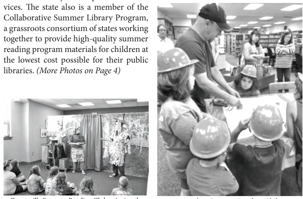
Grantsville Summer Reading Club enjoying the kick-off performance of "Upcycled Cinderella" by Bright Start Touring Theatre

for winning prizes at each branch. Ruth Enlow Library, Western Maryland teers who helped to make Summer Reading Club a success. Without such help, not be possible.